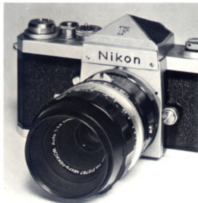
Photo-Macrography The Auto Micro Nikkor is also designed for photo-macrography (greater than 1:1 reproduction). This involves the use of accessories placed between camera body and lens to provide the needed additional extension. These include the Nikon Bellows Attachments 2 and 3, E-Ring and extension tubes.

Automatic Diaphragm The lens is equipped with automatic-reopen diaphragm which remains operative over the entire focusing range, even when using the M-ring. It also has provision for coupling to the Nikon Photomic and Nikkormat meter systems.