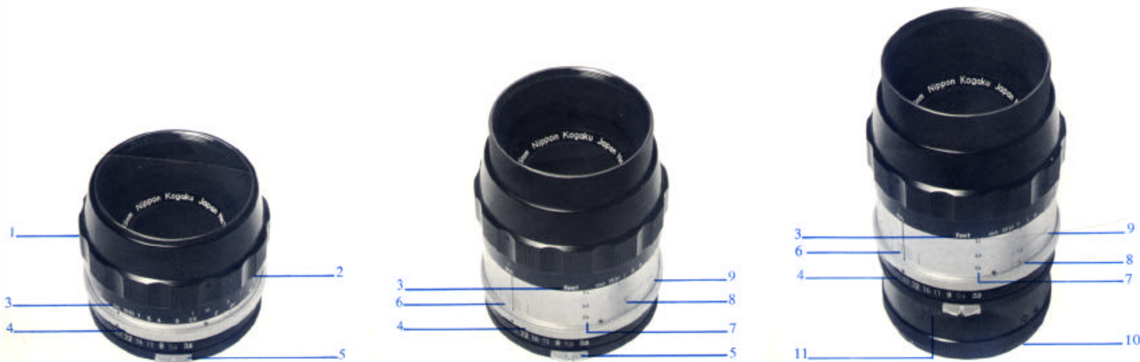
1—Focusing ring 2—Magnification scale 3—Focusing scale 4—Aperture ring, with numerical aperture scale 5—Meter coupling 6—Depth-of-field scale 7—Maximum effective closeup apertures 8—Closeup magnification scale 9—Closeup distance scale 10—M ring 11—M ring numerical aperture scale